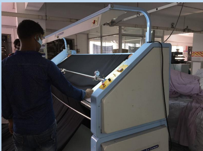
Fabric Check Machine