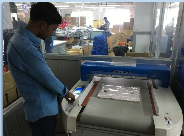
Metal Detector Machine